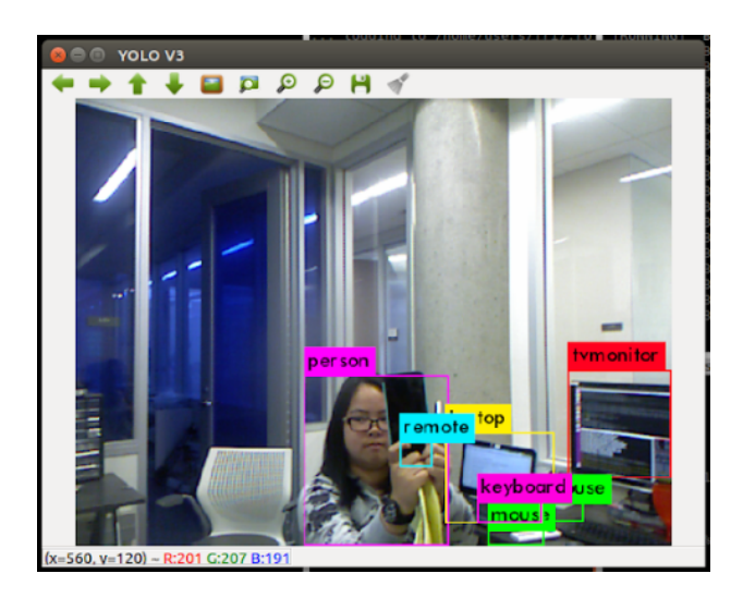
Fig. 1. An example of YOLO working with input from the Microsoft Xbox Kinect in a indoor setting. It recognizes most objects from its databases and then publishes bounding boxes around them.

our object detector was accurately publishing the positions, we created a topic listener that helps us utilize RVIZ to view all the positions of different objects on the map. This topic listener was dynamic as it ran at the same time as the publisher. The robot did not have enough processing power to handle the YOLO publisher, our publisher and our listener together causing the robot's laptop (command line interface) to lag to an unworkable extent. This is when we realized that we need a static listener that was able to access a database of all positions, and added a feature of writing all the positions to a text file. This static listener can be run independently of our publisher, but can only visualize objects in RVIZ that were recorded in the previous run of the publisher.